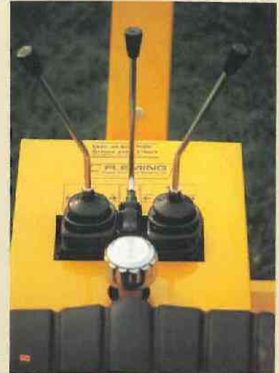
I.S.O. Control Layout